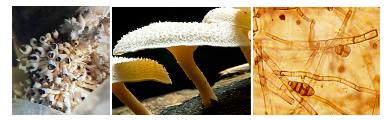
Figure 1. Pestalotiopsis, and Alternaria Mushroom Species